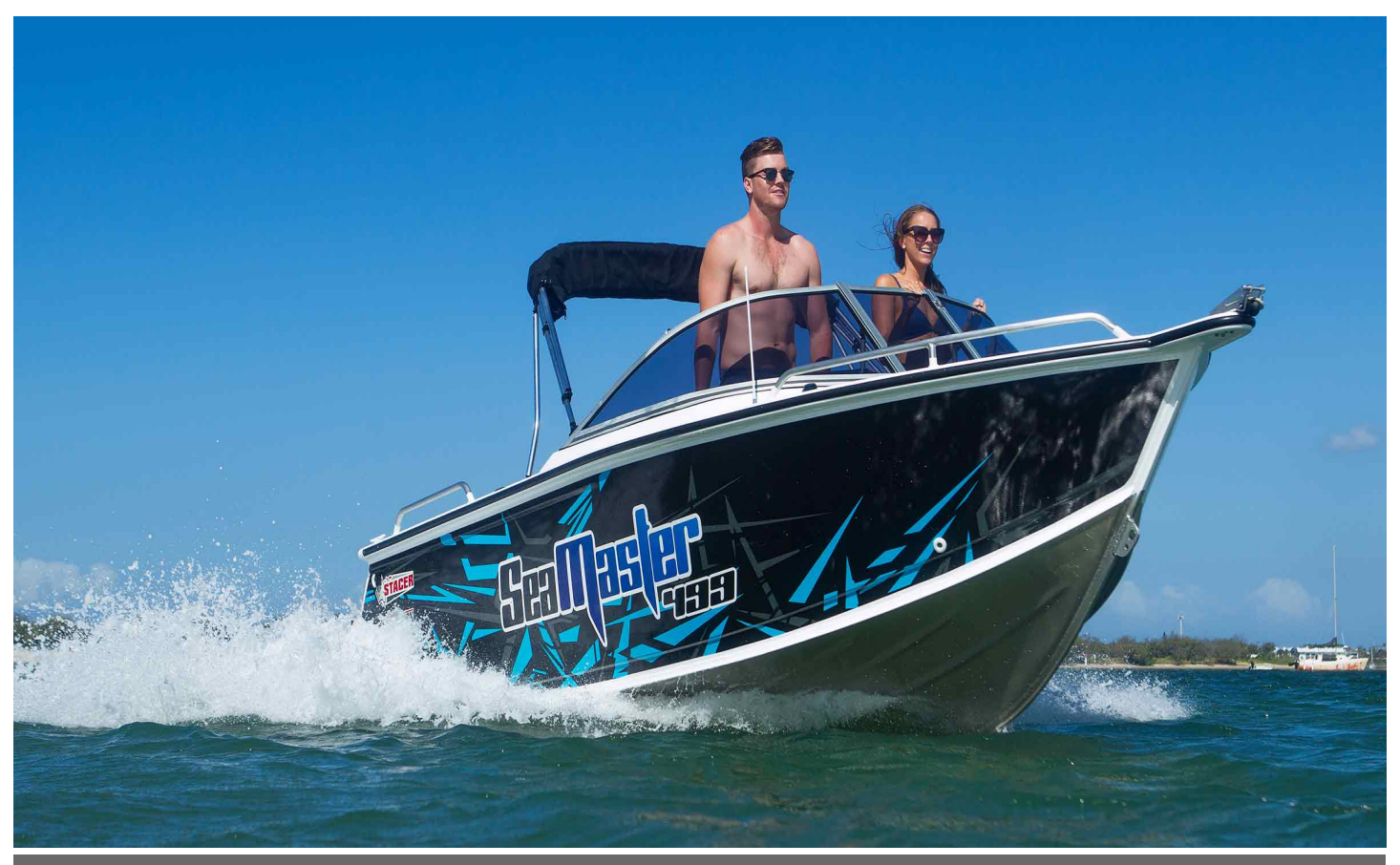
Stacer 499 Seamaster 2023