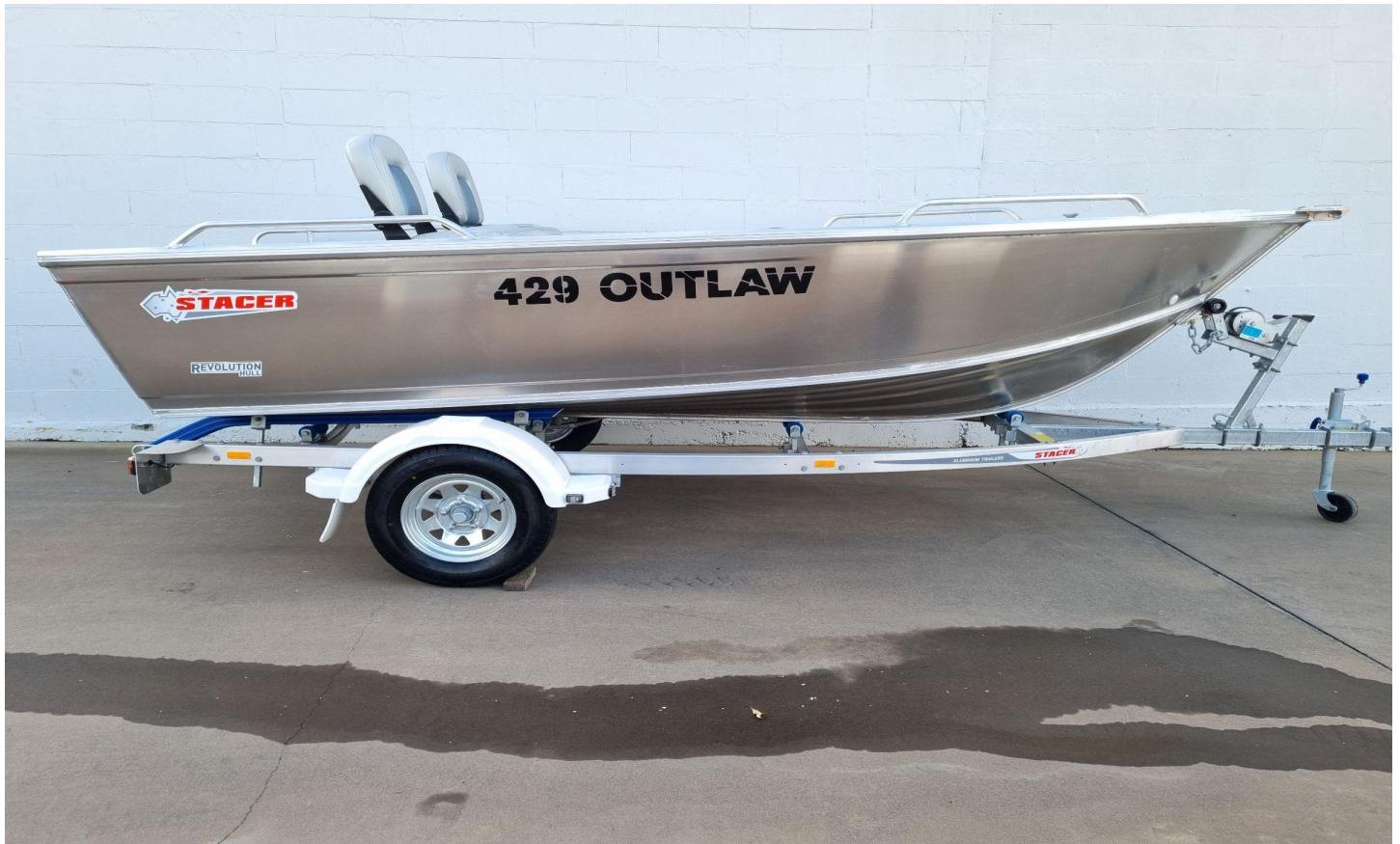
Stacer 429 Outlaw 2024 Revolution Tiller Steer